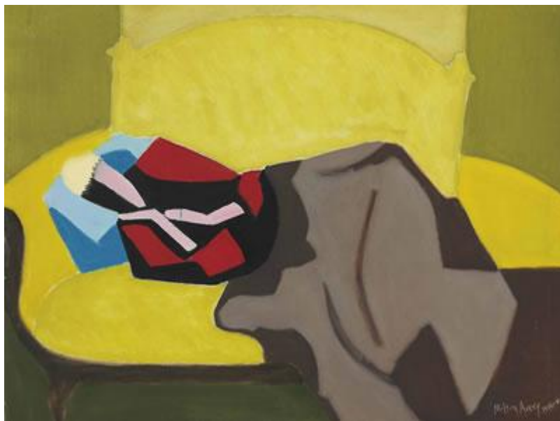
© Artists Rights Society (ARS), New York View larger image and additional information

19TH and 20TH CENTURY MASTERS and ART ADVISORY SERVICES