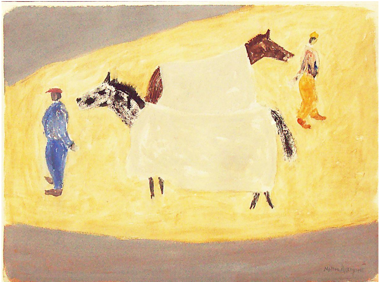
MORNING WORKOUT, 1955

Mixed Media (Oil and Gouache) on paper, 22 \frac{3}{4} x 30 \frac{7}{8} in.