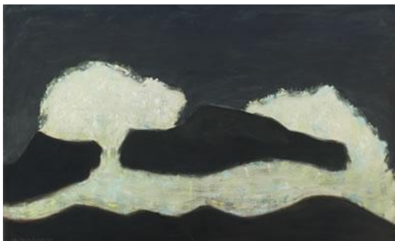
© Artists Rights Society (ARS), New York View larger image and additional information