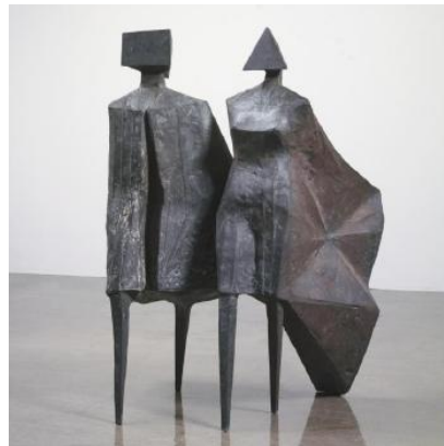
Maquette IV, Jubilee III 1987 Bronze Ed 6/9 37.99 x 27.01 inches Sotheby's NY Nov 10, 2010 lot 216 Estimate $150,000. - $200,000. SOLD FOR $266,500.

19TH and 20TH CENTURY MASTERS and ART ADVISORY SERVICES