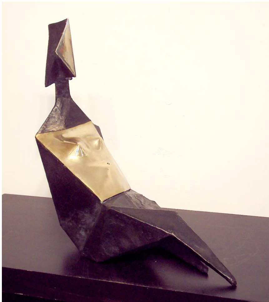
Recumbent Elektra III, 1968