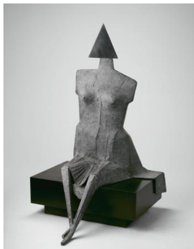
Third Girl Sitting on Bench Bronze, n.d. Ed 3/9 37.5 inches Estimate: $150,000. - $250,000. Sotheby's NY May 8, 2013 lot 459 SOLD FOR $197,000.