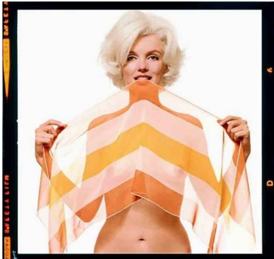
MARILYN 1962 C-Print, 2005.