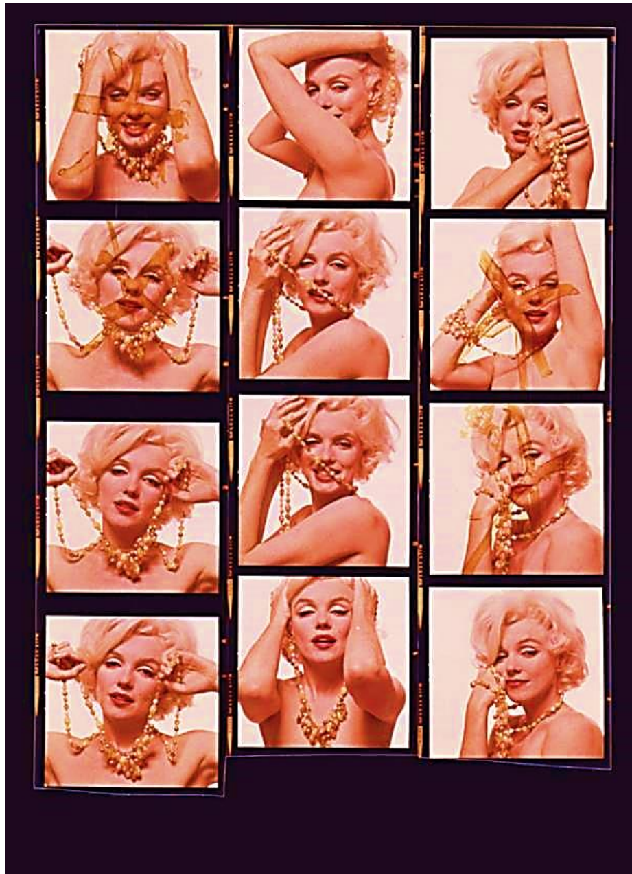
Marilyn 1962-Composite with Necklaces 62 x 44.25 inches Edition of 18 Lifetime print, printing supervised by Bert Stern. $50,000. Bert Stern designed custom frame $2,500.

68 Park Place East Hampton NY 11937 TEL 631 324 3303 891 Park Avenue New York NY 10075 TEL/FAX 212 288 6234 FAX 631 324 4455