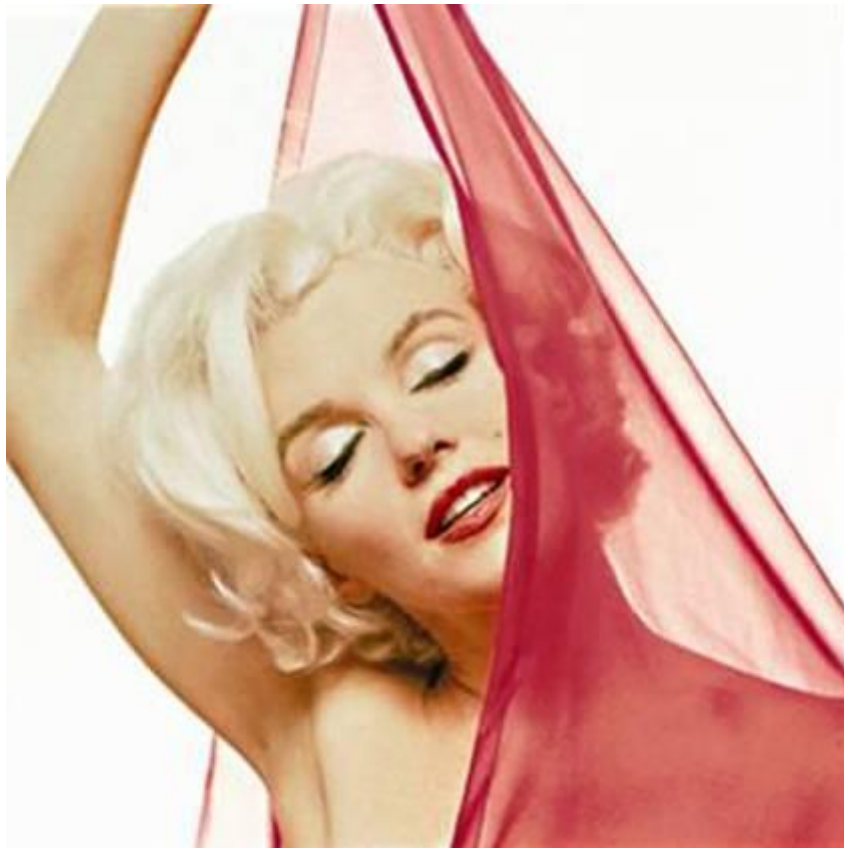
Scarlet Veil 50 x 50 inches Edition of 18 $50,000. Each print is a lifetime print, the printing supervised by Bert Stern Bert Stern designed, custom made frame is $2,500.

"If I'd observed all the rules, I'd never have got anywhere"