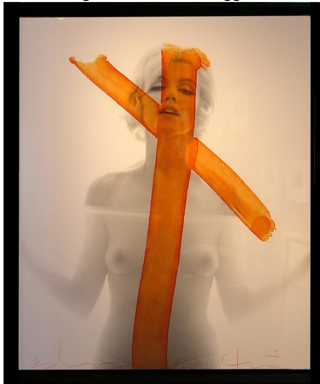
BERT STERN Marilyn Cover of The Last Sitting